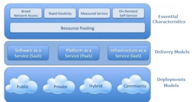
Fig. 1 NIST Visual Model of Cloud Computing Definition

There are many definitions and explanation of cloud computing. There is yet no single, commonly agreed definition of "cloud computing." The National Institute of Standards and Technology (NIST) has defined it as follows "Cloud computing is a model for enabling convenient, on-demand network access to a shared pool of configurable computing resources (e.g., networks, servers, storage, applications, and services) that can be rapidly provisioned and released with minimal management effort or service provider interaction." [4].